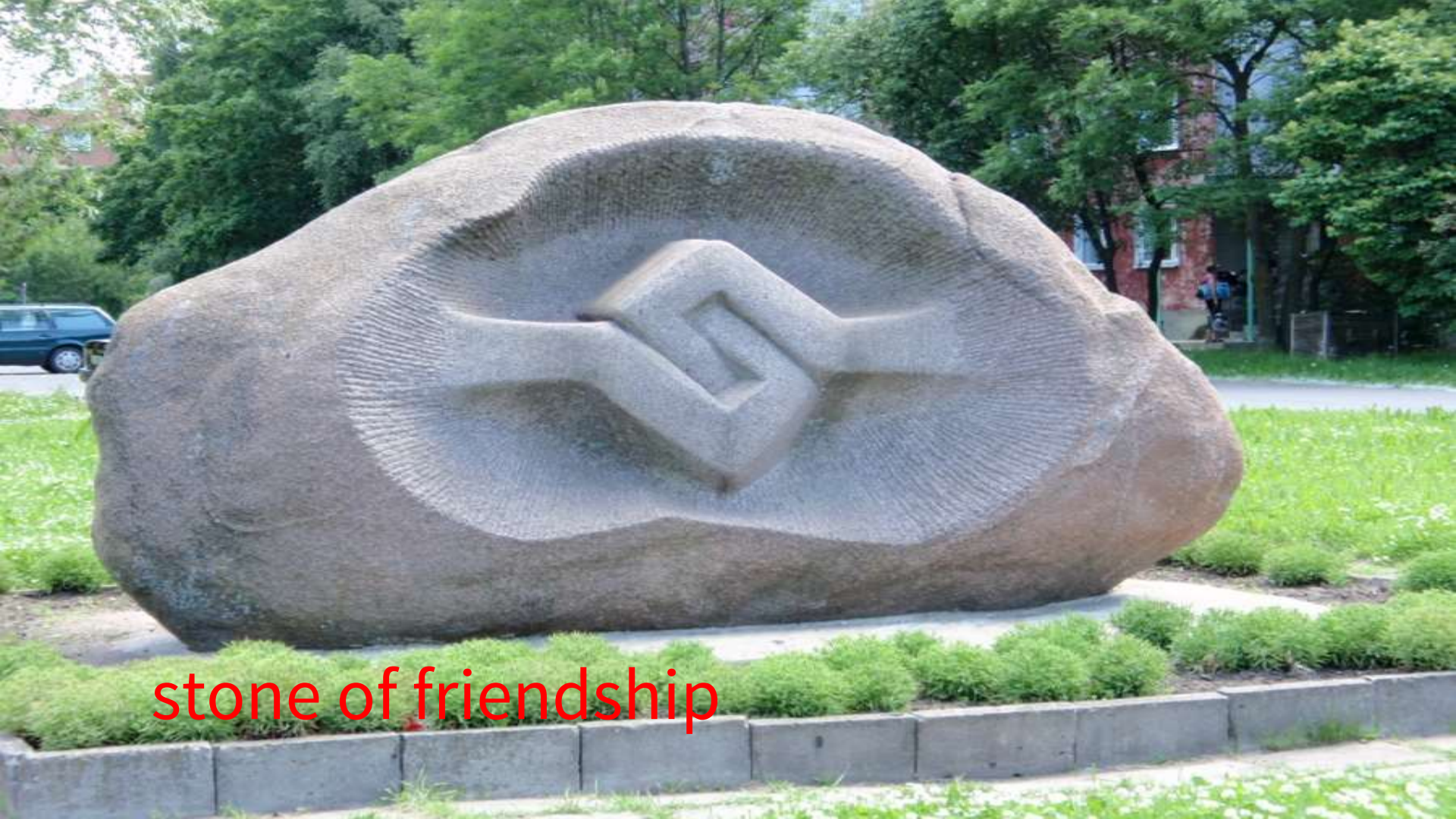
stone of friendship